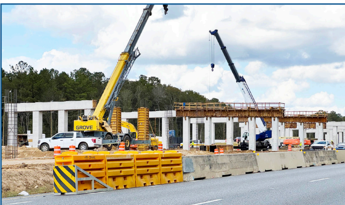
6.6-mile I-69 extension north of Houston scheduled for completion in 2029

the confluence of I-69, I-10 and I-45 on the north side of Downtown Houston.