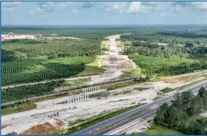
6.5-mile relief route in construction around Corrigan in East Texas